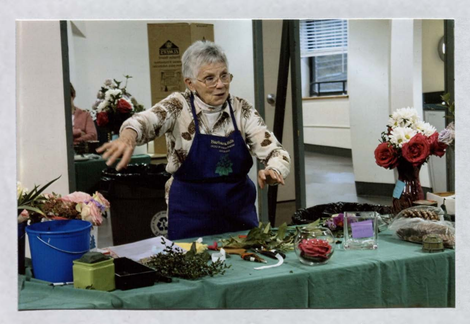
Worls were with beaber + munes