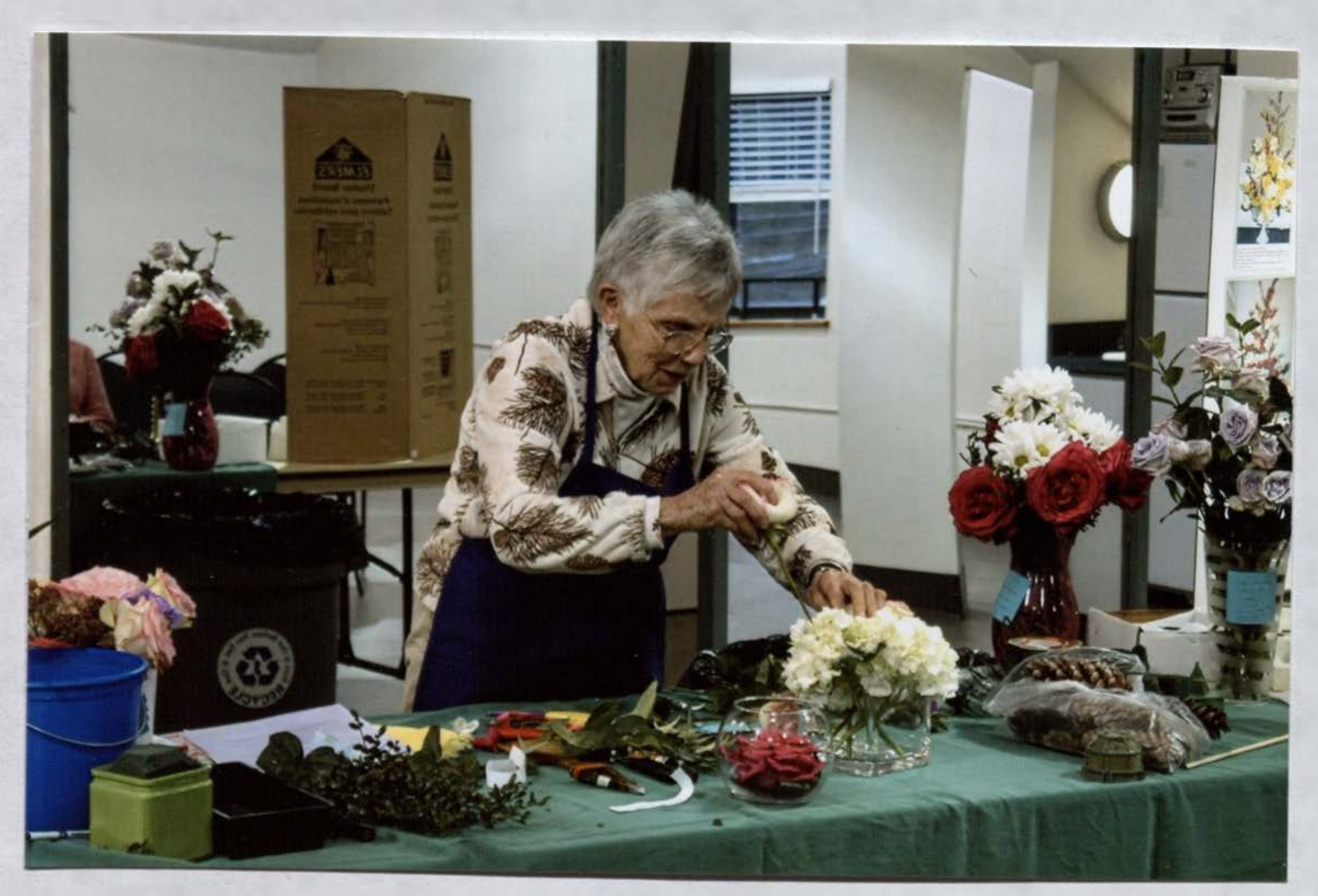
Usens Hydrompea as a mechanic to hold a the Glaver