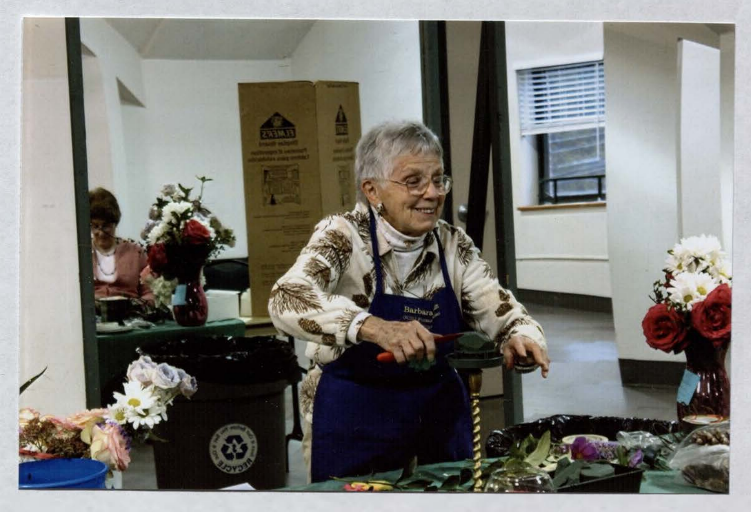
using an o dap to for canal holder